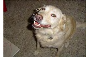
Cleo smiling about her new home