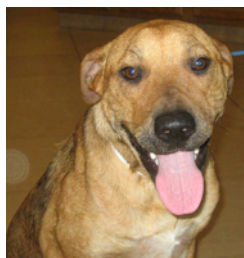
JoJo waiting for his medical work

JoJo and a puppy buddy were found on the side of a busy road scrounging for any food scraps they could find. Both dogs were quite thin and JoJo couldn't put any weight on his back left leg. The woman, who saw them, pulled her car over, took out some dog food and they both came running! No trouble for these two guys to jump in the back seat. So, off they went to a safe new place called a foster home. The puppy was taken to the vet, medical work was