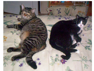
Friskers and his buddy