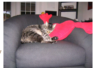
Elmo's got the good life