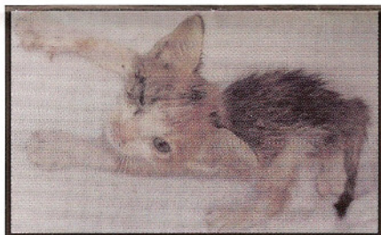
Her first night

The kitten didn't put up much of a fight when she got the two sudsings to remove the multitude of fleas and the dried blood from their bites. With her wet fur, it became obvious just how skinny she