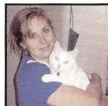
Bunny & her mom