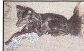
Roscoe with a toy