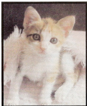
Fiona fully recovered

After two weeks of total TLC, Fiona had gained a pound, tested negative for feline viruses and was ready to meet the other kittens in the household. It didn't take long for her to become involved in everything she saw going on. Adoption day