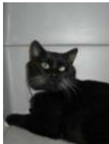
Boots (~2 Years Old)

My name could be Sweetie instead of Boots because I am a real lover of people. My story is pretty grim as I was a stray who was out begging for food and hoping for help. I was constantly being beaten up by other cats (which is why I really don't like them much) because I am such a gentle guy and would never fight back. As a result, I have lost some toes on one paw, am blind in one eye, and have only part of a tail (the other part had to be amputated).