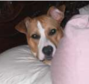
Bella! Snuggling on Mama's Pillows

For other wonderful dogs and cats needing homes, please call us at 713-862-7387 , or view them on our website at www.hppl.org or go to www.petfinder.com and search for HPPL.